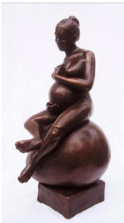
Bronze Original Size: 18"h x 7"w x 9"d | $5,800.