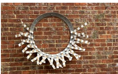
Luna Lymphoblast Mixed Media Bricolage $2000