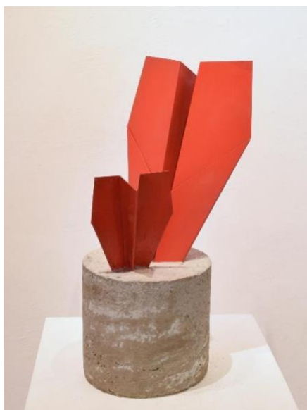
Red Plane Aluminum & Concrete $2,000