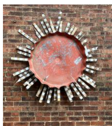
Pantone #0522 ACGT Myeloblast Red Mixed Media Bricolage $2000