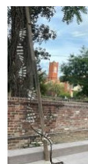
Δύο ίδιες κόρες Mitosis and Meiosis Mixed Media Bricolage $ Commissions upon request.