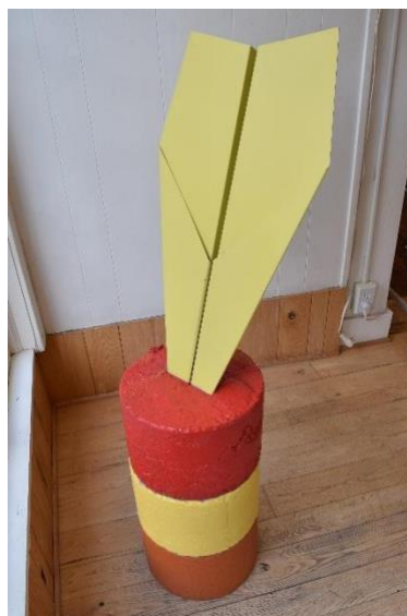
Yellow Plane Aluminum & Concrete $3,000