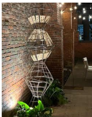
Introduced Species Bricolage with wire and fabric, $2,200